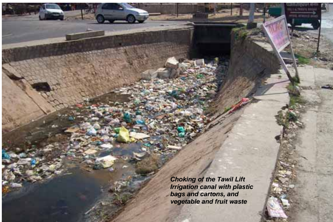
Choking of the Tawil Lift Irrigation canal with plastic bags and cartons, and vegetable and fruit waste

The international observance of World Water Day is an initiative that grew out of the 1992 United Nations Conference on Environment and Development (UNCED) in Rio de Janeiro. UN-Water has chosen Clean Water for a Healthy World as the theme for World Water Day, on 22 March 2010.