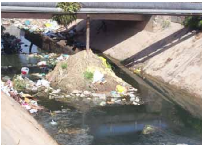
A large mass of silt, waste material and plastic bags accumulated around a small pole in the canal